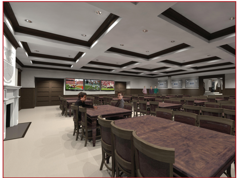
Dining Hall/Multi-Purpose Room