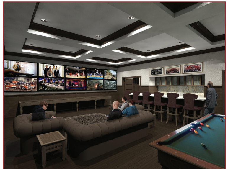
New Recreation Room on the First Floor