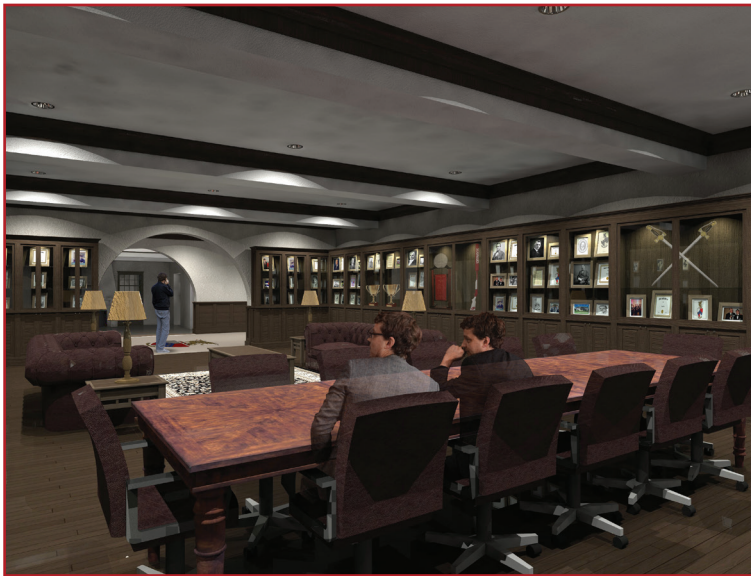
Library in the Current Dining Hall